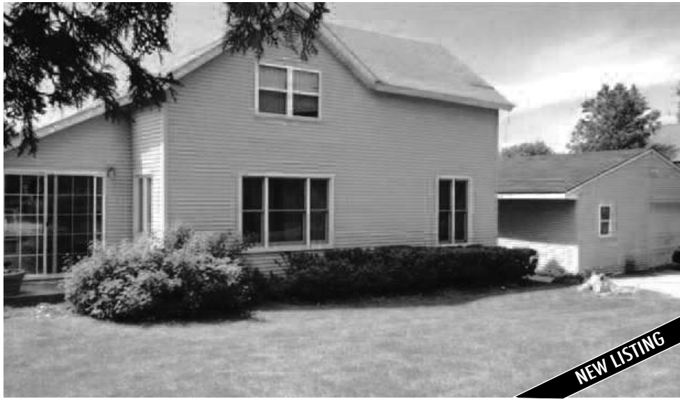
00853 FOURTH STREET • CHARLEVOIX