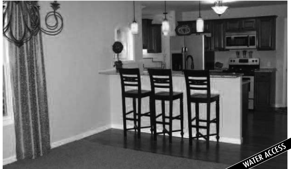
03451 COMMODORE, EAST JORDAN

A unique sun style room is full seasonal living space, and Lake Michigan is only a short distance away. The relaxing, large backyard adds to the outdoor enjoyment you'll receive with this great home. Located in the "village of Norwood" gives the comfort of some neighbors but still the overall out-in-the-country feel of peace and quiet, call for a 48 hour appointment today. MLS 434203. Ask for Mike Stark.